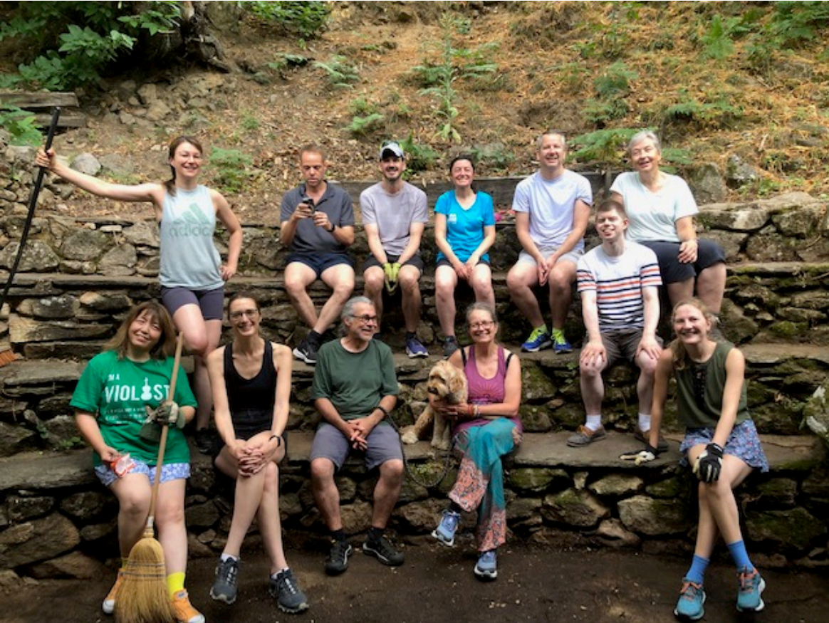
And after... with the cleaning team