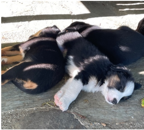
Seamus 2 months old

Oh, and we forgot to say that of course he is the loveliest, most handsome dog that walked this earth!